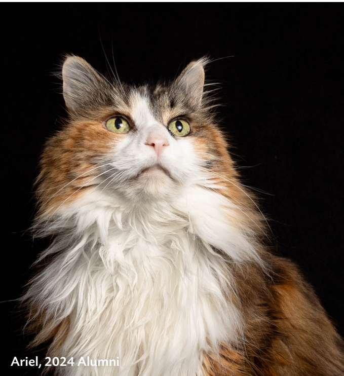
Ariel, 2024 Alumni

As a shelter that started in the basement of a vet clinic back in 1969, our mission has always been to provide compassionate care, rehabilitation, and safe haven to companion animals in need. With the support of our community, we've grown for the good and have been able to impact the lives of thousands of animals in need.