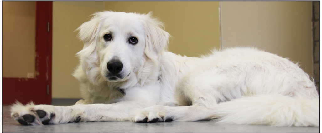
Zoey, a 10-month-old Great Pyrenees mix spent a few months at the shelter before leaving for her forever home in October. Under our care, she was spayed, microchipped, dewormed, vaccinated, socialized and more.

By receiving so much one-on-one attention from our volunteers and staff, Zoey began to rebuild her confidence and started standing a little taller. She even started to run around, play, and would roll over for a