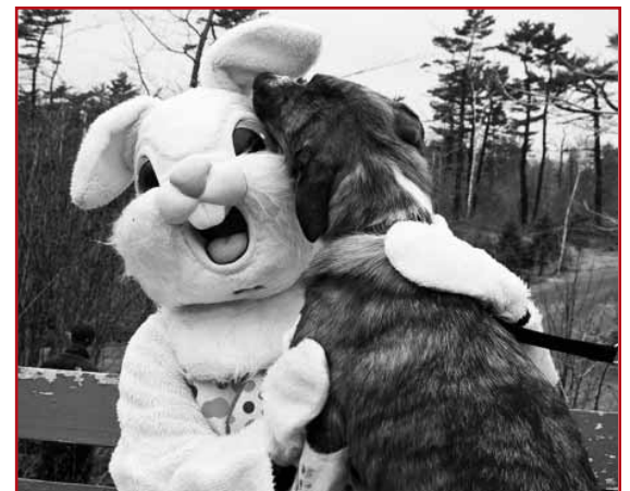
Everybody loves the Easter Bunny