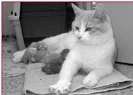
Katie and her babies

On April 8th, Katie delivered five beautiful kittens. This gives Katie another honor – the first birth in our new maternity wing. She's a wonderful mom and a very loving cat who really deserves the special place she's made for herself in our memories and Bide Awhile history.