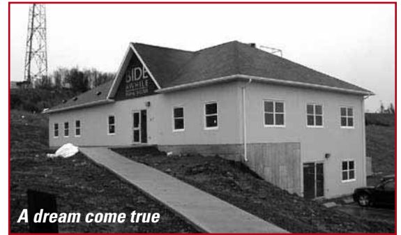
A dream come true

I would like to end this column with a note about the importance of money! Our donors have supported this project from the moment our capital campaign started. They have shared our enthusiasm and excitement and have stepped up to the tune of $480,000 to date.