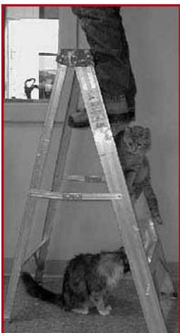
Two new Apprentices for RCS

Please know that your kindness and support will make a world of difference to the lives of homeless animals in our community. We could not have done this without you.