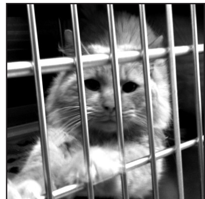
Pekoe at Bide Awhile