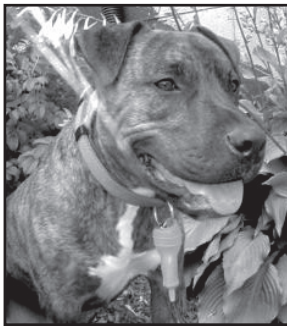
Jax at the Shelter

Jax is a handsome one year old American Staffordshire Terrier and like any one year old, he's busy exploring and trying to understand his world. We know because he stayed with us at Bide Awhile for more than 3 months after his world fell apart. His original family gave him up when they found that the combination of a new baby and a young active dog was just too much to handle.