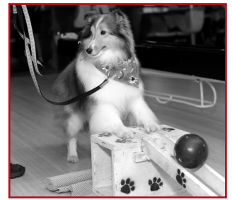
Bowling Critter, Delta