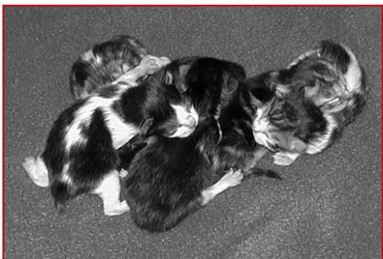
Nap time for Madonna's six babies