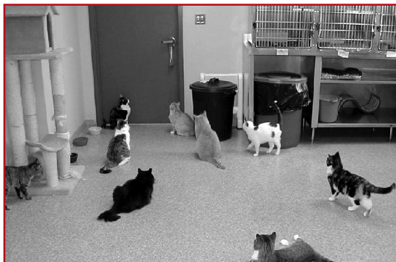
Is that a can opener?